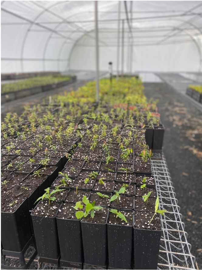
Inside the new nursery tunnel at 25 weeks – set to grow the first 7000 trees!