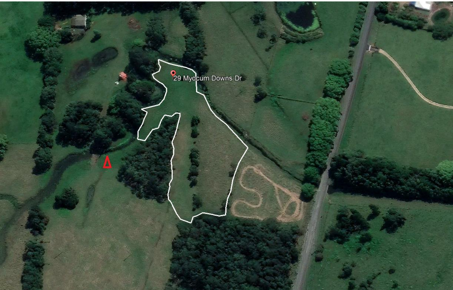
Figure 2 Site area at 29 Myocum downs drive. Note creek lines are not marked, but are visible wrapping around the planting site on three sides. Note forest bottom right, middle and top right - now joined