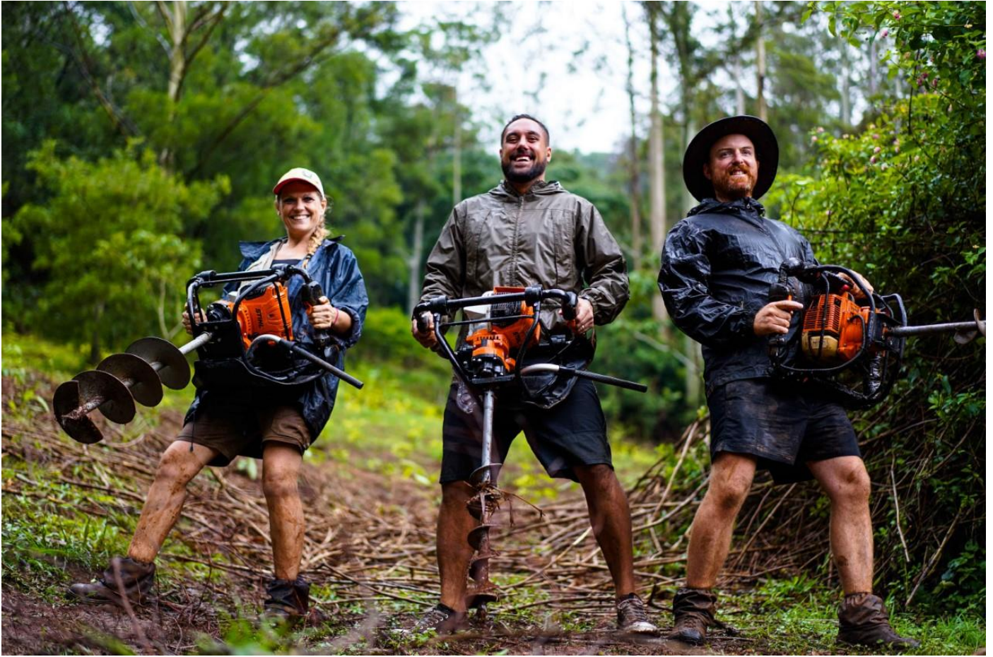
Figure 6 Stihl BT 131 Augers pictured. Your donated machine will drill up to 3,000 holes per week for tree plantings for several years!

An additional Earth Auger was purchased on the 27 th of August bringing us up to a total of 7 of these machines for drilling holes for tree planting as we come into the tree planting season.