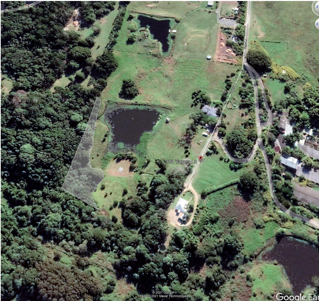
Figure 4 33% of a hectare was cleared of significant weeds to allow rainforest remnants to expand (front cover photo taken in the bottom left hand corner).

The regenerated works completed cover 0.33 hectares, or 3,300 square meters of rainforest. What was done is called "Primary works" – this is best described as the first complete run through where all discernible weeds are eliminated. Examples of tasks completed accompany photos below.