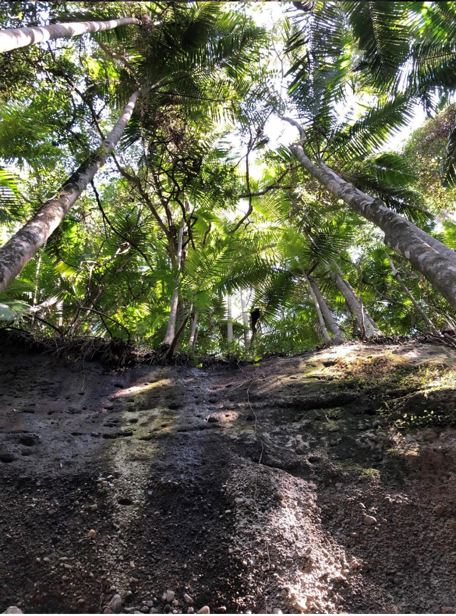
(Left): Above your regeneration area is the Hayter's Hill Rainforest reserve. It is one of the few areas that survived the logging of the 1850's to the 1880's. The reserve has mostly survived intact or been regenerated by rainforest regenerators over the recent years.