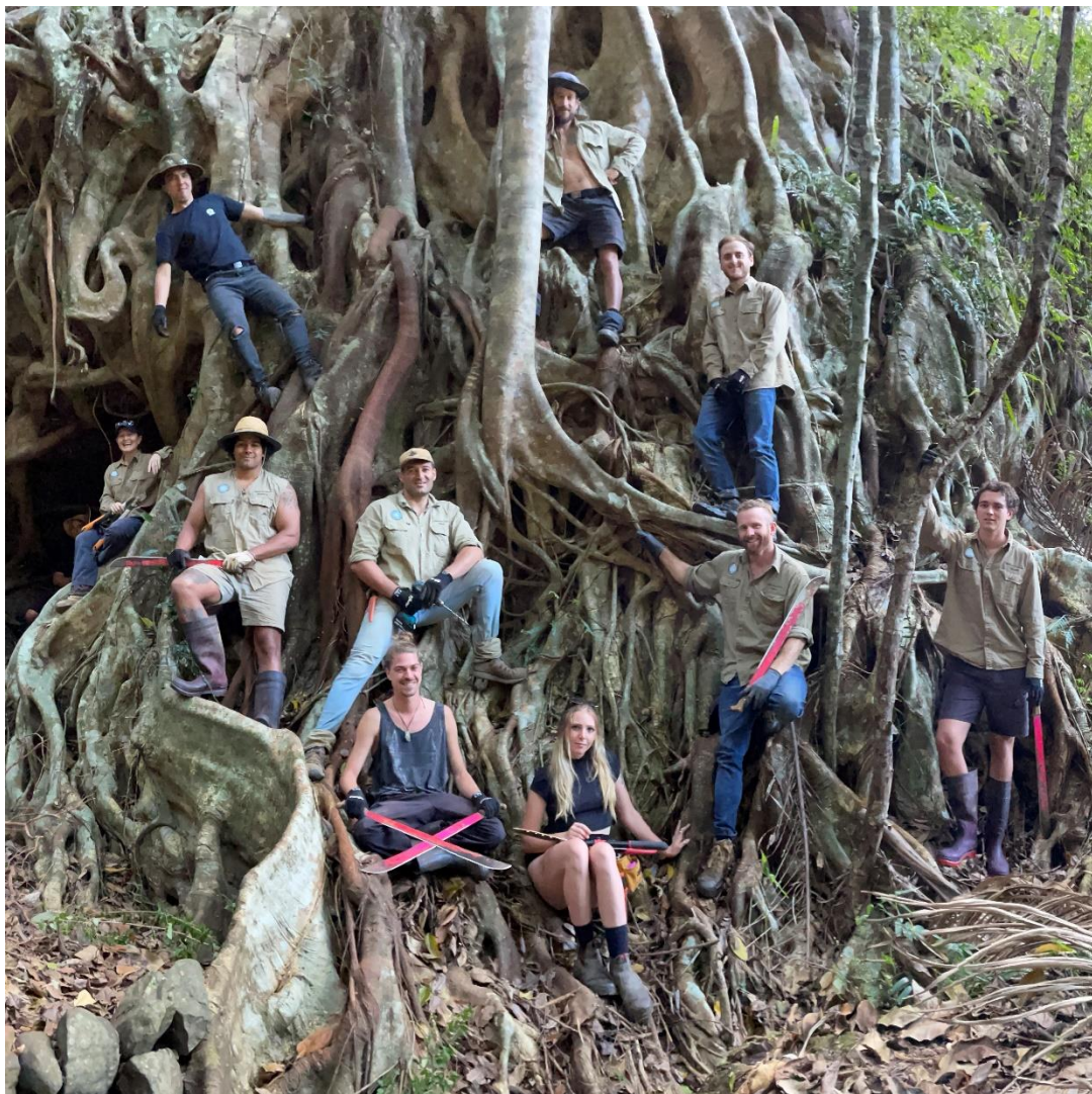
Figure 1 Photo from the day. This giant strangler fig has made roots over 60 or more square meters of ground. The result of being seeded on the side of a cliff. This image is the far bottom left corner of the working zone highlighted in the map.

$5,000.00 AUD donated 17 th August 2021.