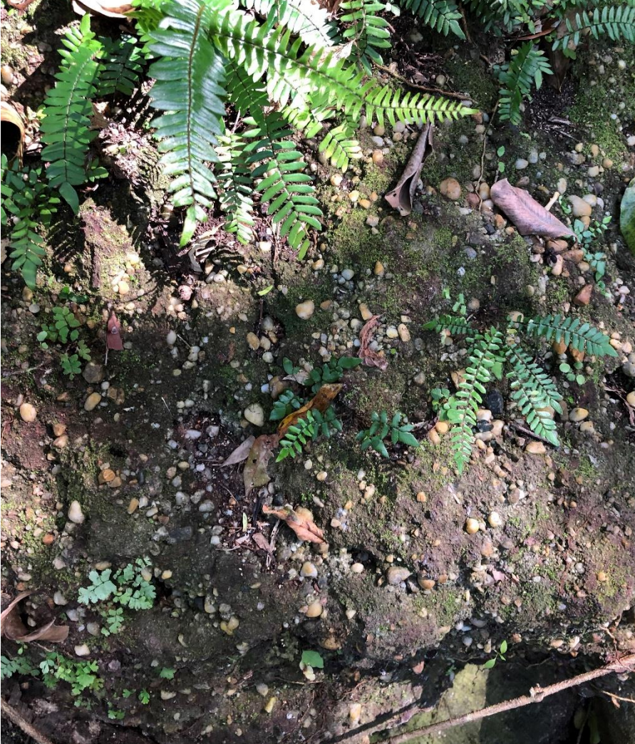
(Left) Maiden's hair fern grows only on rocky, permanently moist areas. Here below a small waterfall in your regeneration area.