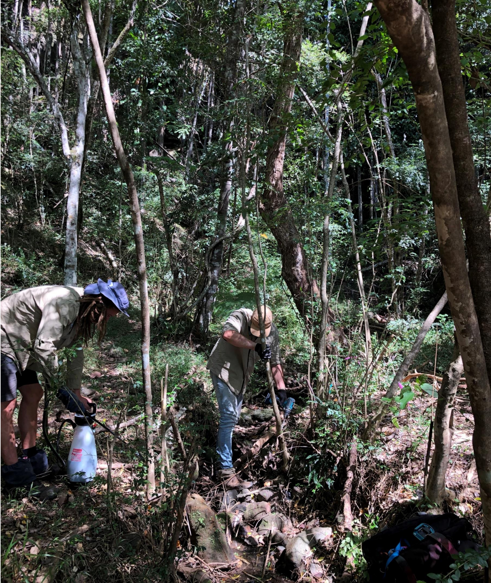
Figure 3 Here staff drill invasive weeds from China with poison. The chemical is discretely absorbed, allowing for nearby native rainforest trees to expand faster.