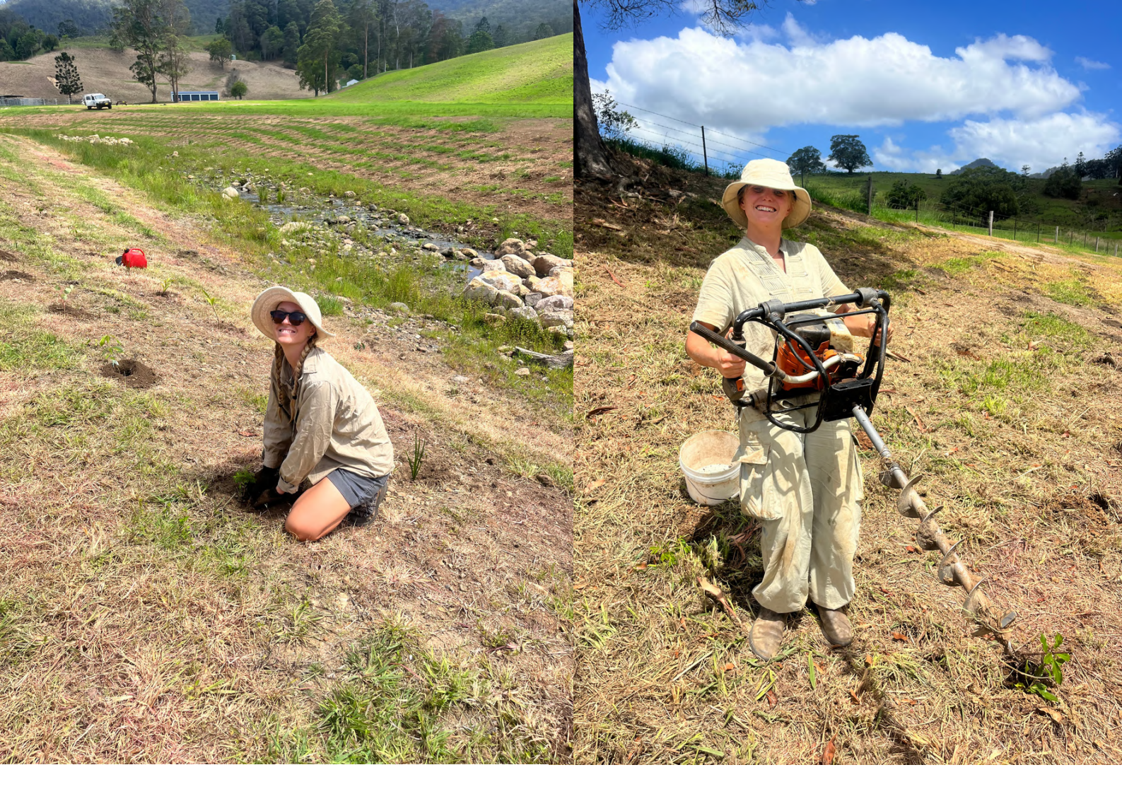
Photos from the planting days, November 14th + 16th - 900 Doon Doon Road