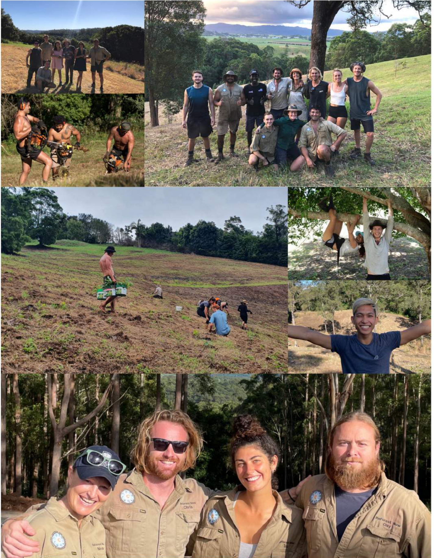
Images: Our team of passionate ReForesters and volunteers growing rainforest together.