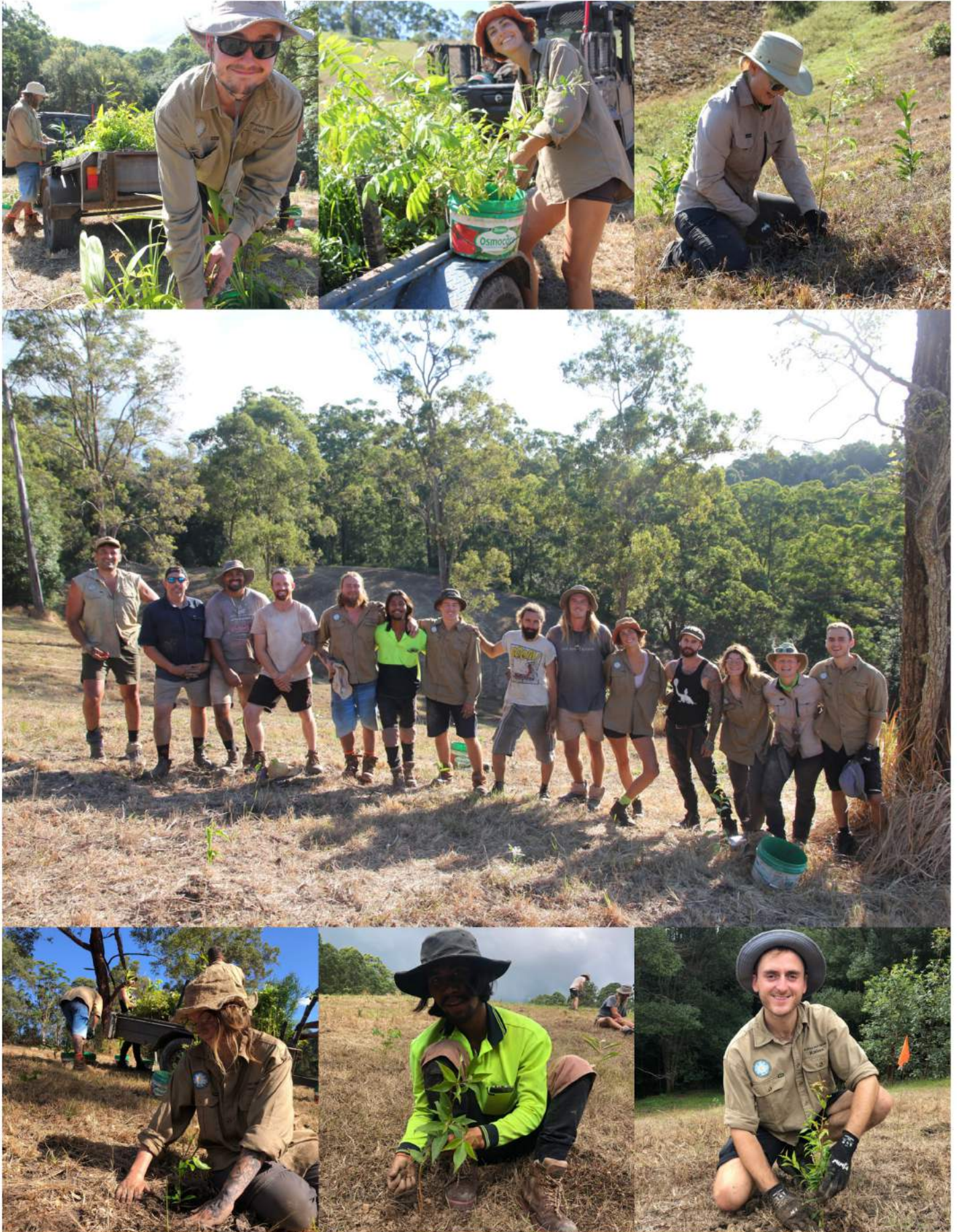
Images: ReForest Now planting crew at one of our mega project sites in South Murwillumbah.