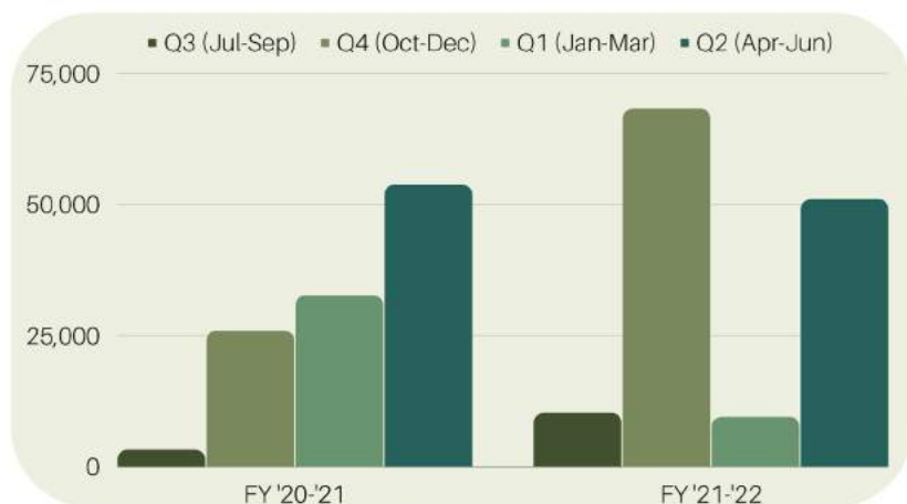
Table 1: Rate of Tree Planting for the financial years '20-'21 & '21-'22.

* more species were planted (bought from outside)