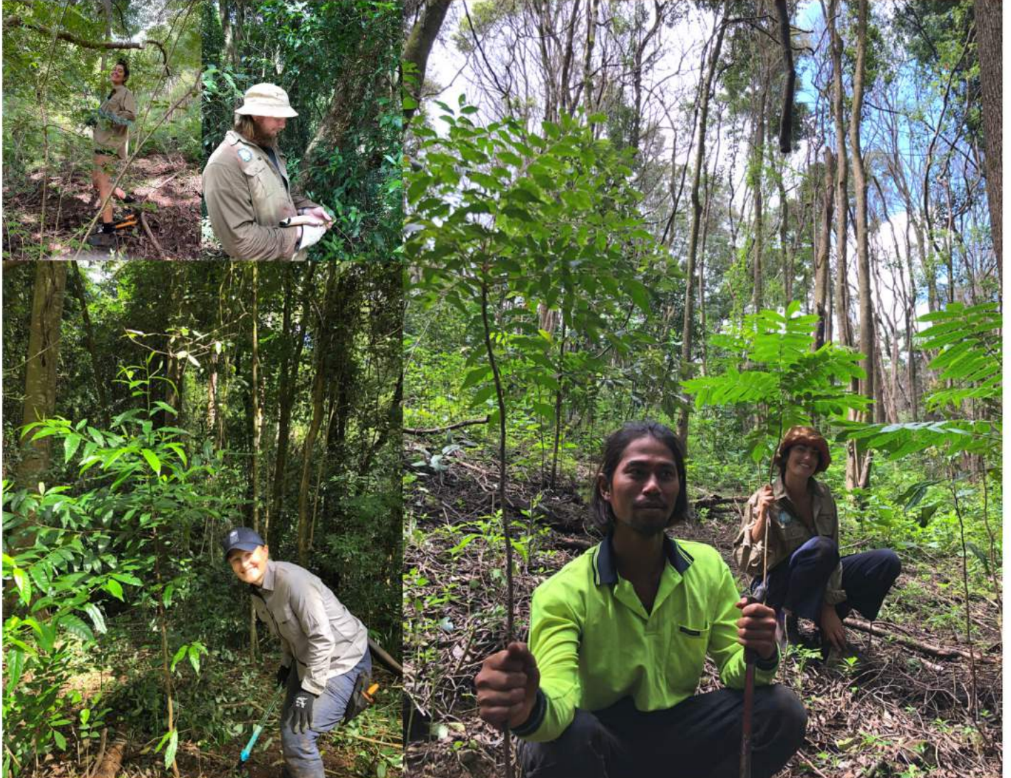
Images: Our nursery in Mullumbimby (top) and some of our bush regenerators in the forest (bottom).