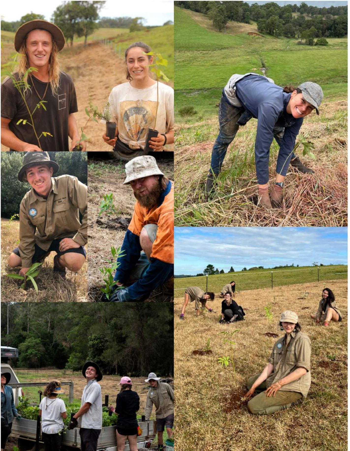
Images: Our crew planted 139,165 native species in 50 days of planting this financial year '21-'22.