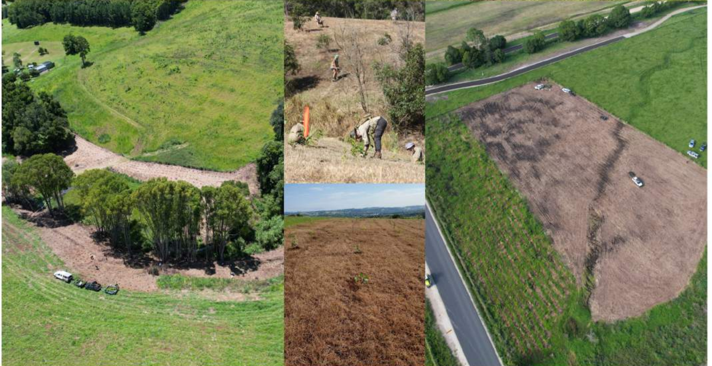
Images: In this financial year '21-'22 we planted on a variety of sites. 28 sites, all planted with a diverse mix of native species.