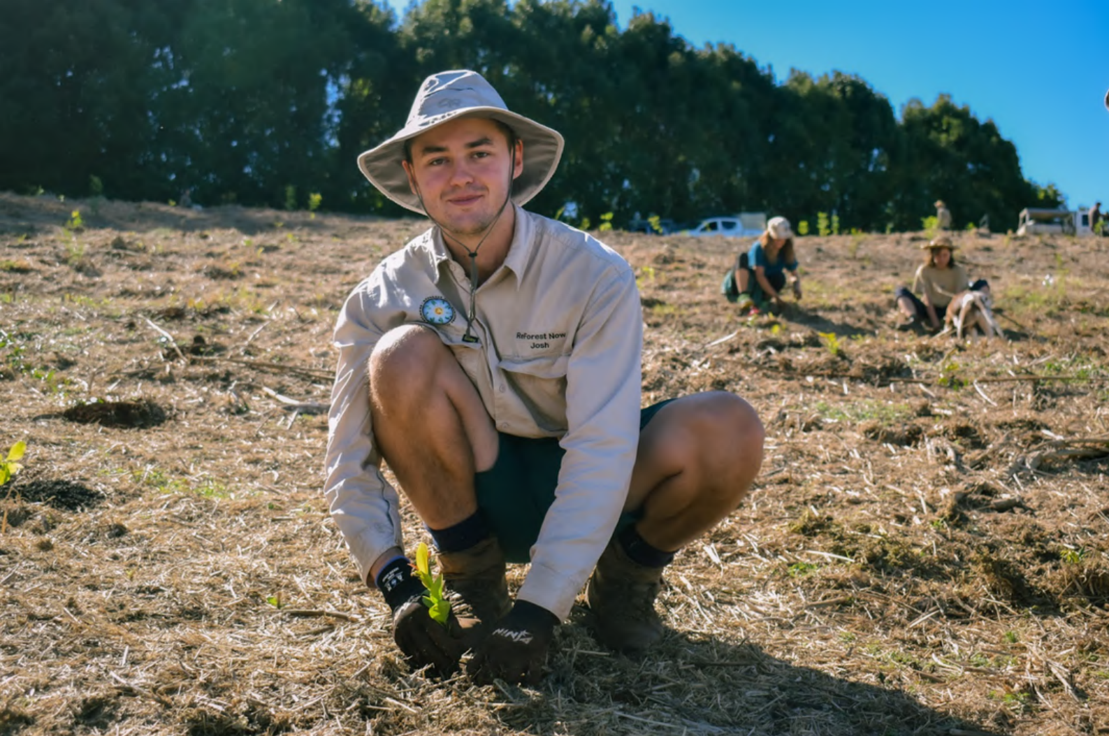
Photos from the day, June 1st - 113 Stewarts Rd, Clunes NSW